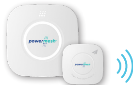
Powermesh Door Controller and Sensor *