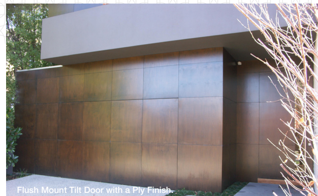
Flush Mount Tilt Door with a Ply Finish