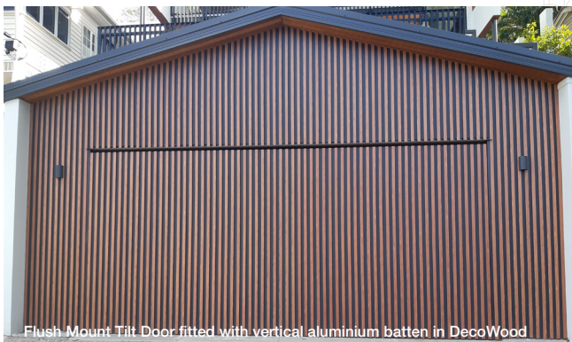
Flush Mount Tilt Door fitted with vertical aluminium batten in DecoWood