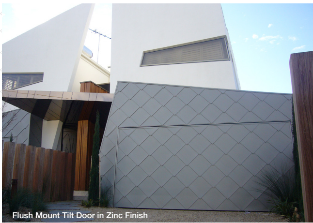
Flush Mount Tilt Door in Zinc Finish