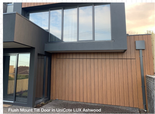
Flush Mount Tilt Door in UniCote LUX Ashwood